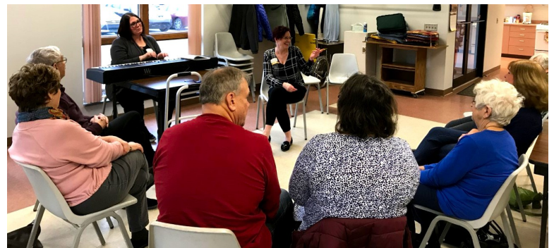
March 2nd program attendees participating in a sing-along