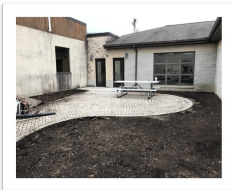
Refurbishing is already underway!

The Library has earmarked some of the revenue raised at our fall fundraiser, Beer for Books, for the project, but South Fayette Township, Friends, and local businesses are also chipping in.