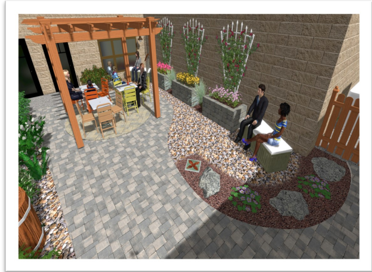
3D rendering courtesy of Dave Pencoock, Artisan Landscape Designs

The courtyard will serve as the library’s outdoor environmental education hub and provide quiet reading and working space for our library patrons. Exciting components of the new space include a pergola, rain barrel, refurbished beds filled with native plants, comfortable furniture, and a gated fence. Our Youth Services Staff is especially excited because they are going to be able to increase our environmental education programs and bring some of our existing programs outside when the weather is nice.